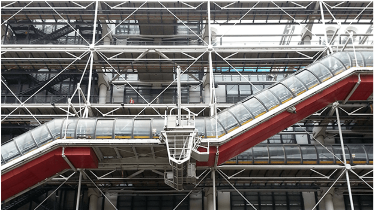
Swettenham / CC-BY-NC-SA

Scaffolds initially provide substantive foundational knowledge, offer sequenced opportunities for understanding new ideas, and are gradually withdrawn as learners construct their own ways of understanding the material. Learning activities are designed to link to students' personal goals, connect theory to practice, and invite deep and critical reflection.